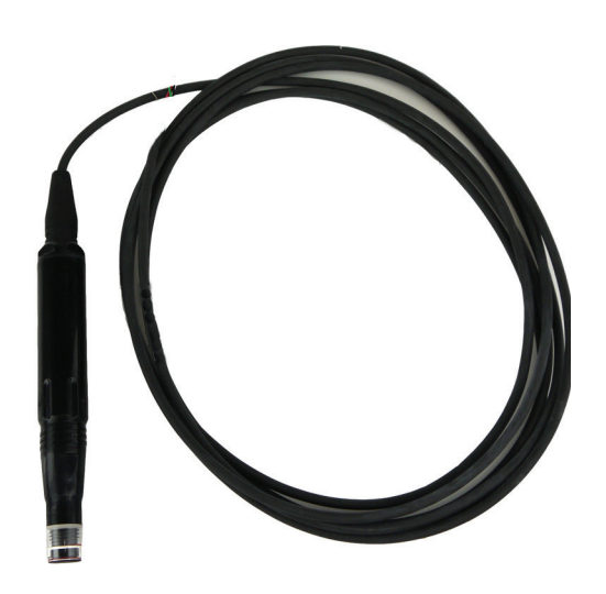
Parameters: Dissolved Oxygen (optical) Temperature